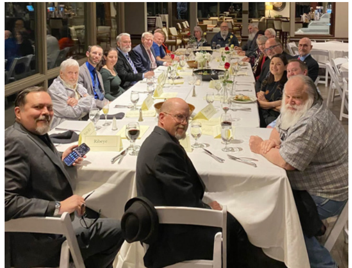
A good time, good Masonic Fellowship and a delicious dinner were had by all at our recent Ladies Appreciation Dinner!